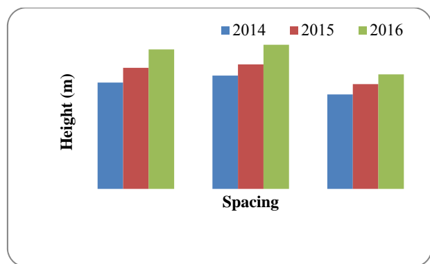
Fig. 2: Diameter and height with respect to spacing in different years